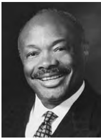
Willie L. Brown, Jr. (D) Dec. 1980–June 1995