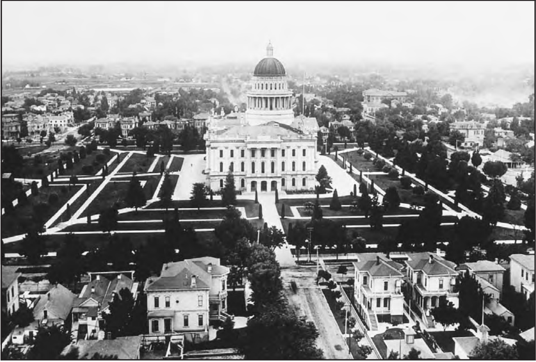
Capitol Grounds, circa 1890 (photo taken from hot air balloon)