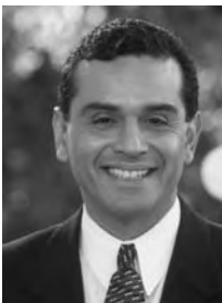
Antonio R. Villaraigosa (D) Feb. 1998–Apr. 2000