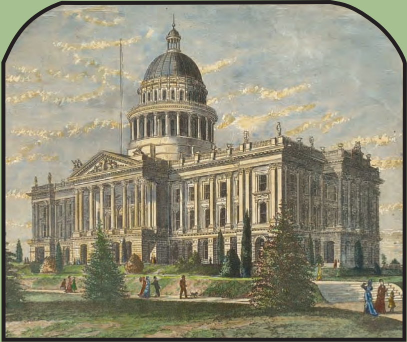
A RARE COLOR LITHOGRAPH SHOWING THE STATE CAPITOL, CIRCA 1880. ( Lithography courtesy of University of California, Berkeley )