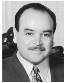
Cruz M. Bustamante (D) Dec. 1996–Feb. 1998