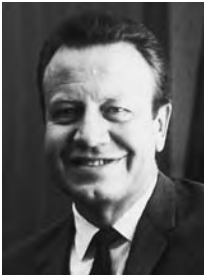
Jesse M. Unruh (D) Sept. 1961–Jan. 1969