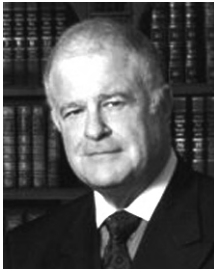
Don Perata (D) Dec. 2004–